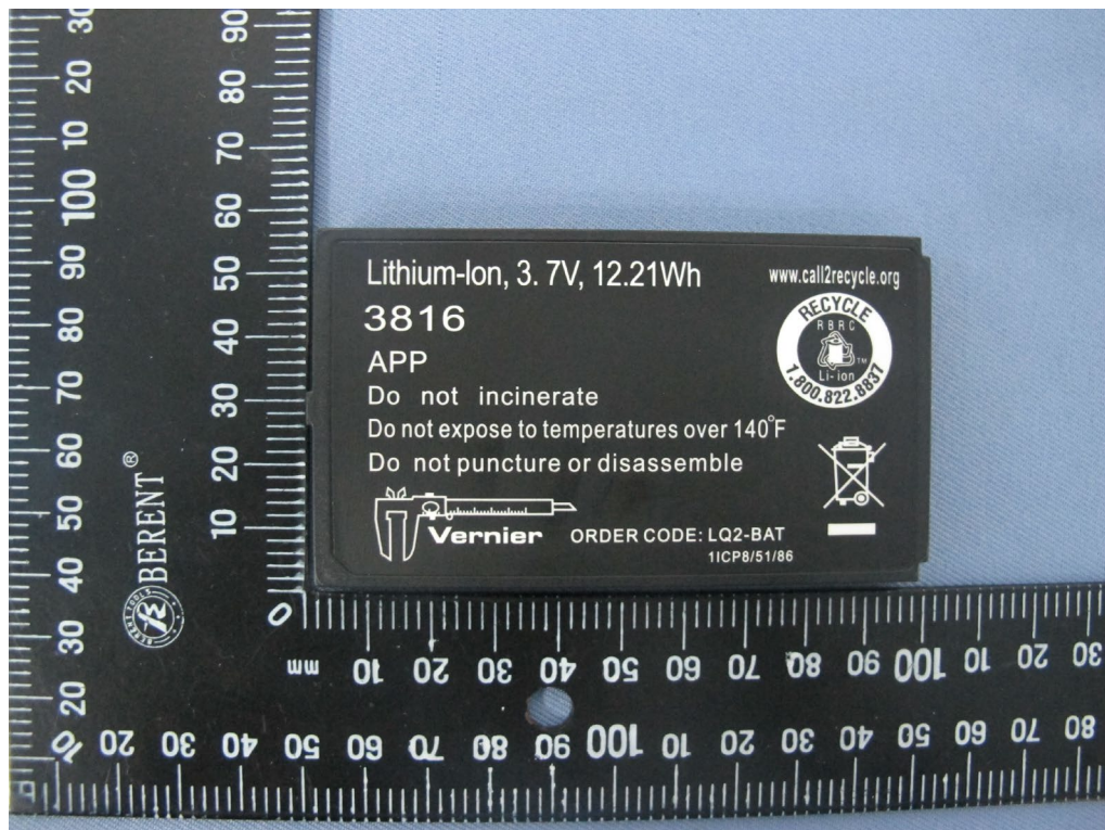
Figure 1 Overall view I of battery (外观图I)